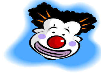
Arts & Crafts (incl. face painting)

For further information, please contact: