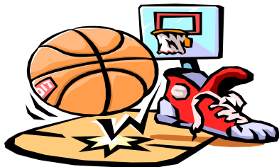
Outdoor ball games (incl. face painting)